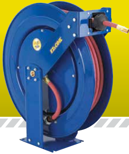
Triple axle support with a full frame & Super Hub™

COXREELS® EZ-T Series "Truck Mount" spring driven hose reels are the toughest hose reels in the spring driven line. The extra large chassis with dual pedestal-style arms and Coxreels' Super Hub™ provides triple axle support while reducing vibration and strengthening the structural integrity of the reel. Making it perfect for off-road applications that demand reliability in the most abusive and demanding environments.